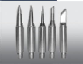
Replacement Soldering Tips H Series